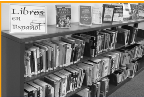
The Library carries an assortment of Spanish titles in fiction and non-fiction as well as English language learning tools for non-native speakers.

With such a large number of non-English speaking people in Westmont, the library is working hard to provide materials and resources to meet their needs.