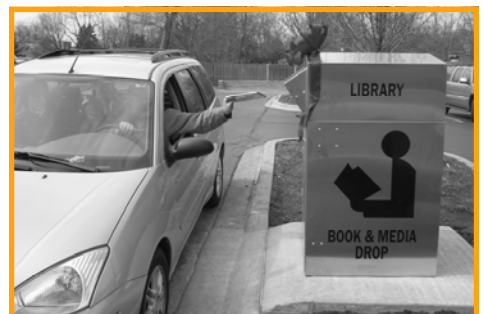
A family tries out the new drive-up book drop for the first time.

to install the book drop in response to requests from residents who have mobility issues or small children.