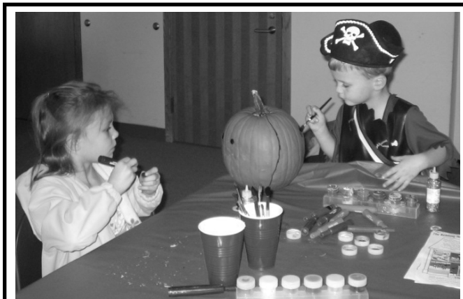
Children take turns decorating a pumpkin at the Fall Festival in October. The library gave away 40 pumpkins!

Pirate Day √ Saturday, April 12th From 1-2:30pm Ages 8-12